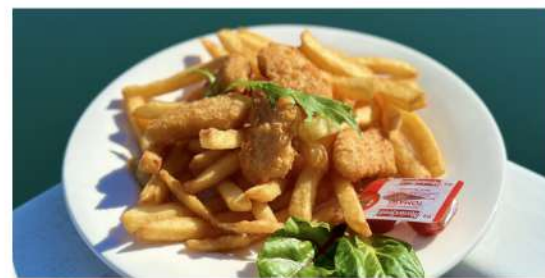
Kids Menu Fish cocktails, chips & tomato sauce