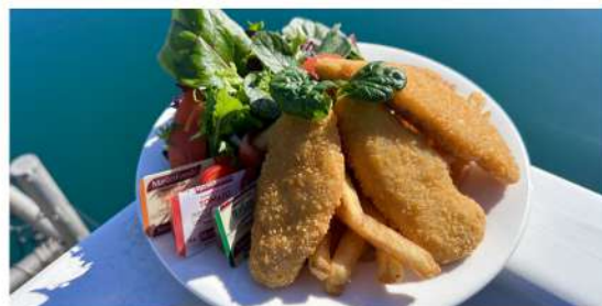
Crispy chicken strips, chips & salad with dipping sauce