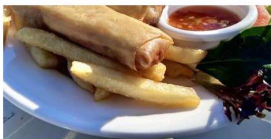
Kids Menu Vegetable spring roll, chips & tomato sauce