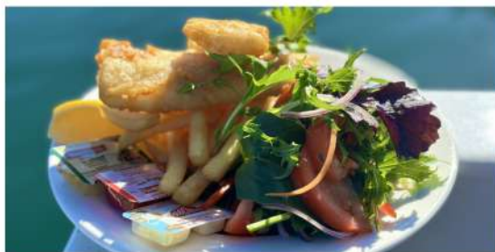
Tempura fish fillets, chips & salad with lemon aioli