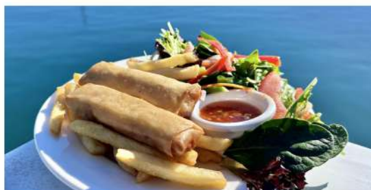
Vegetarian spring rolls with chips & salad with lemon aioli