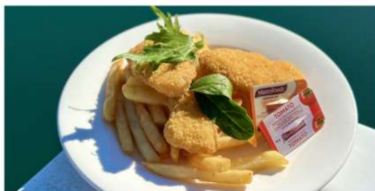
Kids Menu Chicken strips, chips & tomato sauce