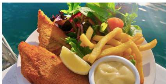
Aussie Snapper panko crumbed fillets, chips & salad with lemon aioli