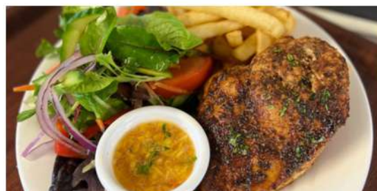
BBQ spiced chicken fillet, chips & salad with pineapple, mango & chilli relish